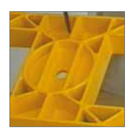
Chassis from ductile graphite iron