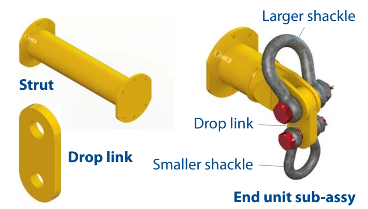
Table 1 – Component List