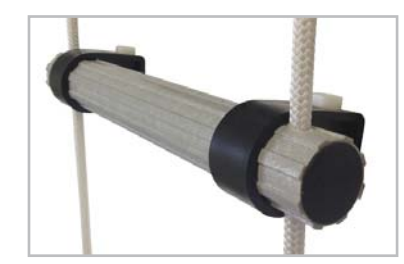
GRP Rung with wire sides