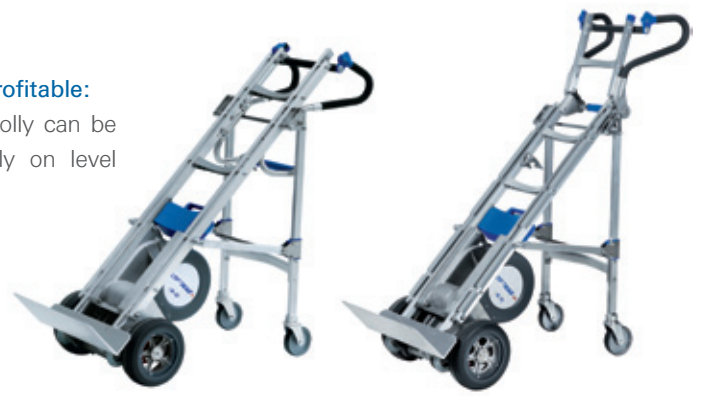
LIFTKAR HD Dolly

Dolly and Fold Dolly can be shifted effortlessly on level surfaces.