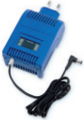
Battery charger BC 100-230 VAC With LCD charging status indicator and battery test function. Part No. 903 606