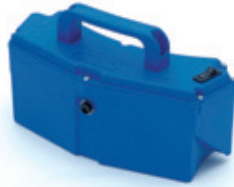
Quick-change battery unit BU Remove and install in seconds. With integrated "On/Off" switch. Part No. 004 110