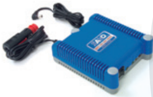
In-transit battery charger BC 10-30 VDC Suitable for 12 V or 24 V vehicle power supplies. Part No. 930 600