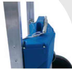
Battery pack retention arm Keeps the battery in place on bumpy ground. Part No. 930 140