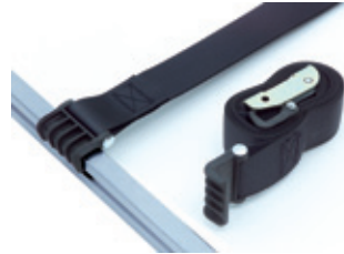
Safety belt – 3.50 m With special hook for safely securing load and heavy-duty metal buckle. Part No. 903 123