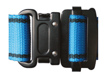
Quick Release Buckles - available for most harnesses