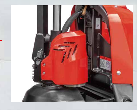
(Optional) Electric lifting/lowering