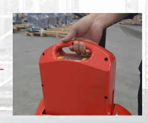
The lightweight battery (max.8.2kg) enables a fast and easy battery replacement, ensuring the operator can double the working time within seconds.