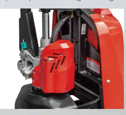
Electric lifting/ Manual lowering