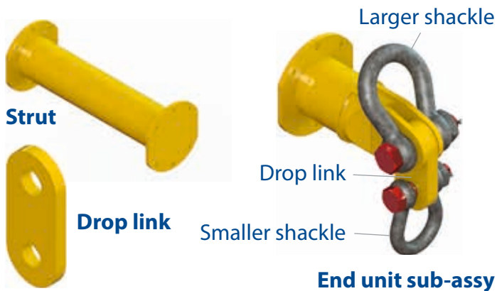
Table 1 – Component List